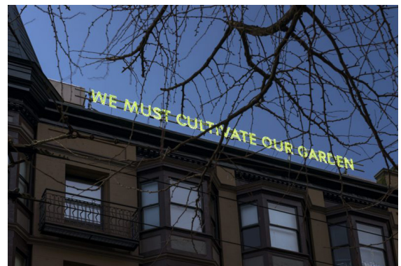
Nathan Coley, We Must Cultivate Our Garden (Vancouver), 2012